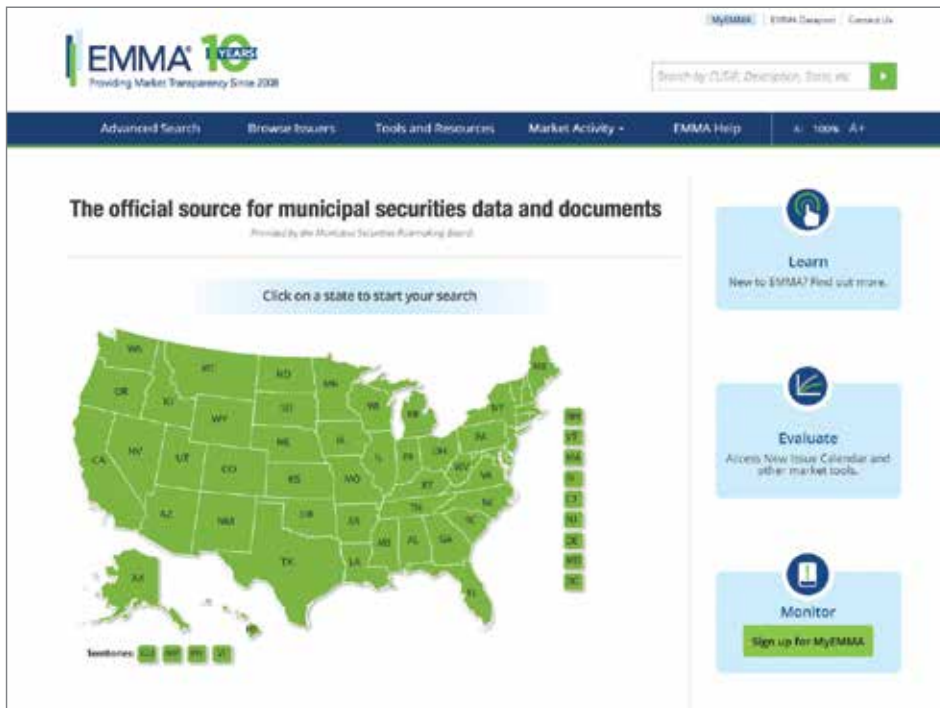
Home page of Emma