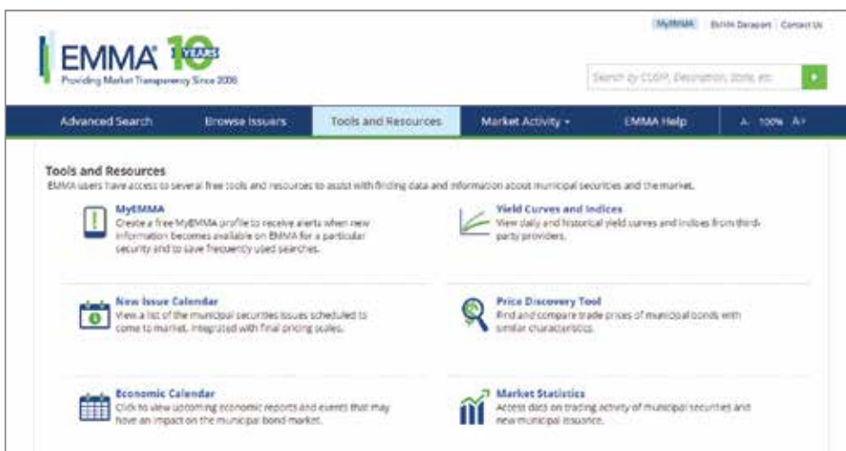
There are many tools and resources available.

ferings up to a month out. The calendar also provides final pricing scales for bond issues sold through competitive and negotiated sales to help you and your clients to see the range of prices, coupons and maturities for recently sold securities. Access the new issue calendar under the Tools and Resources tab in EMMA's main navigation.